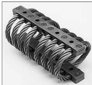
SOCITEC «HELICAL» isolator